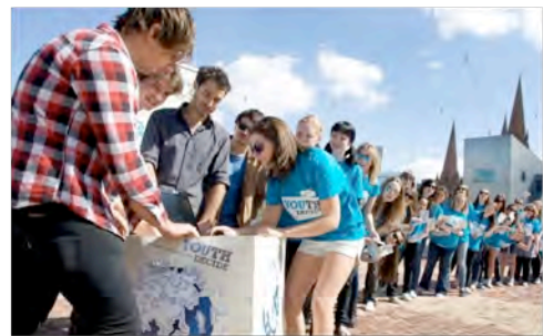
Picture: Young people line up in Federation Square to cast their vote in the Australian Youth Climate Coalition (AYCC) poll on emissions reductions

We can consider reasons three and four together: 'inexperience and ignorance'. Of course young people have less life experience than their elders; that goes without saying. A 65-year-old retired person has less experience than an octogenarian, too. But thanks to the internet and a growing number of new media technologies such as Facebook, Twitter and the iPhone, we are part of the most tech-savvy and switched on generation the world has ever seen. And consider this: as a seventeen-year-old I can currently get married, drive on Australian highways, work a full-time job and pay taxes. I can also have a child and receive a several thousand dollar baby bonus from the federal government for choosing to